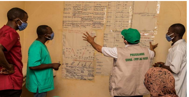
Photo 1: Concern team on a support supervision visit to a health facility in Tahoua region, 2021

This is evidenced by the national ownership of the approach , through the development and adoption in July 2021 of a national strategy for 'The Surge Approach applied to Nutrition' .