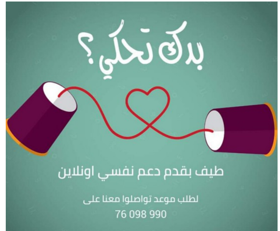
“Want to talk?” mental health support line