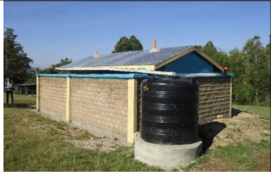
Girl friendly latrines & washrooms