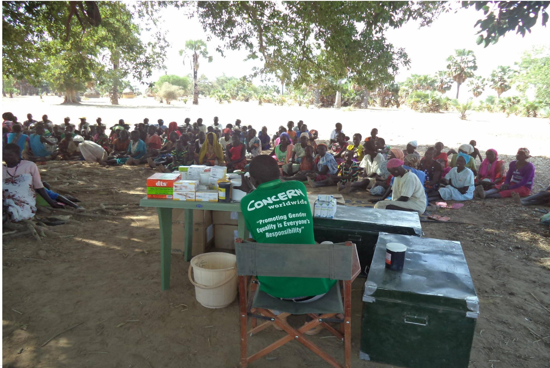
Mobile Clinic at Ajok