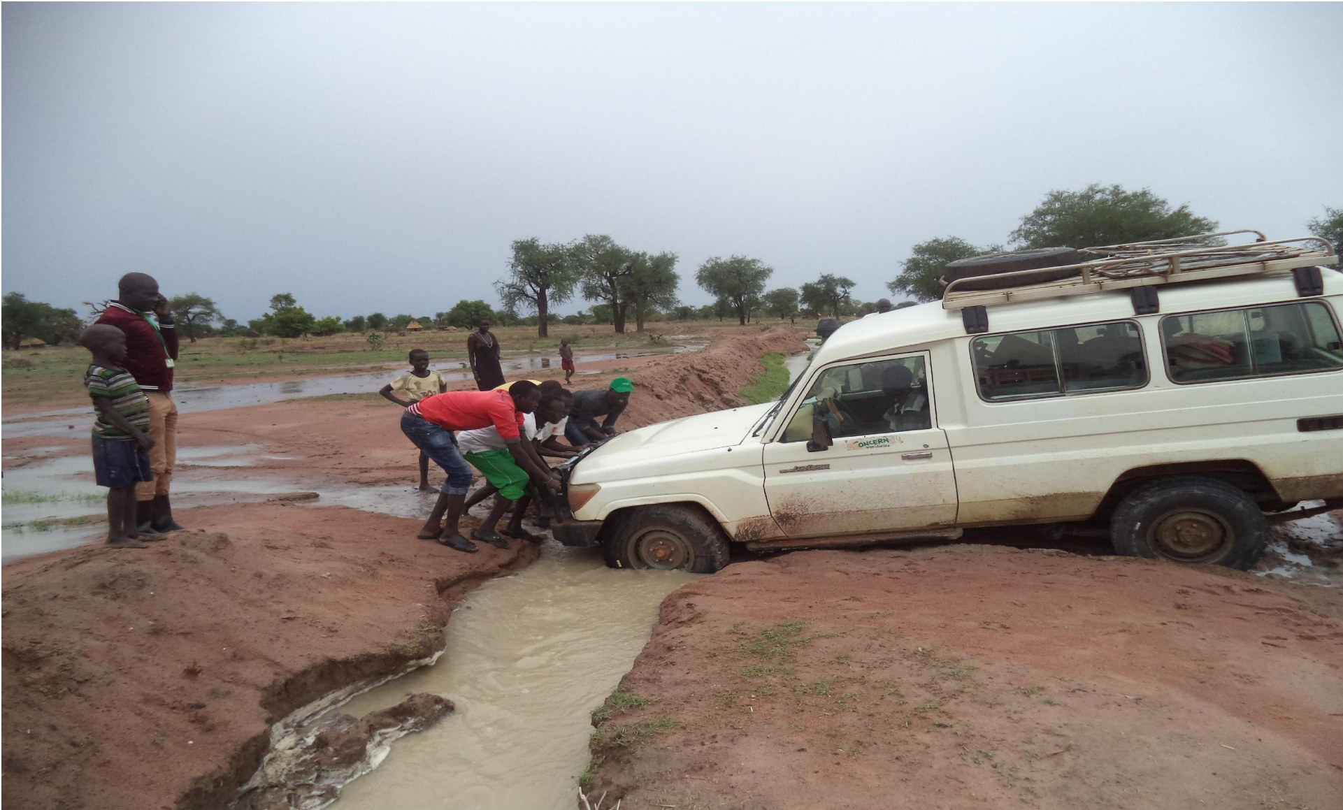
Inaccessibility due to bad roads to Machar Adhot