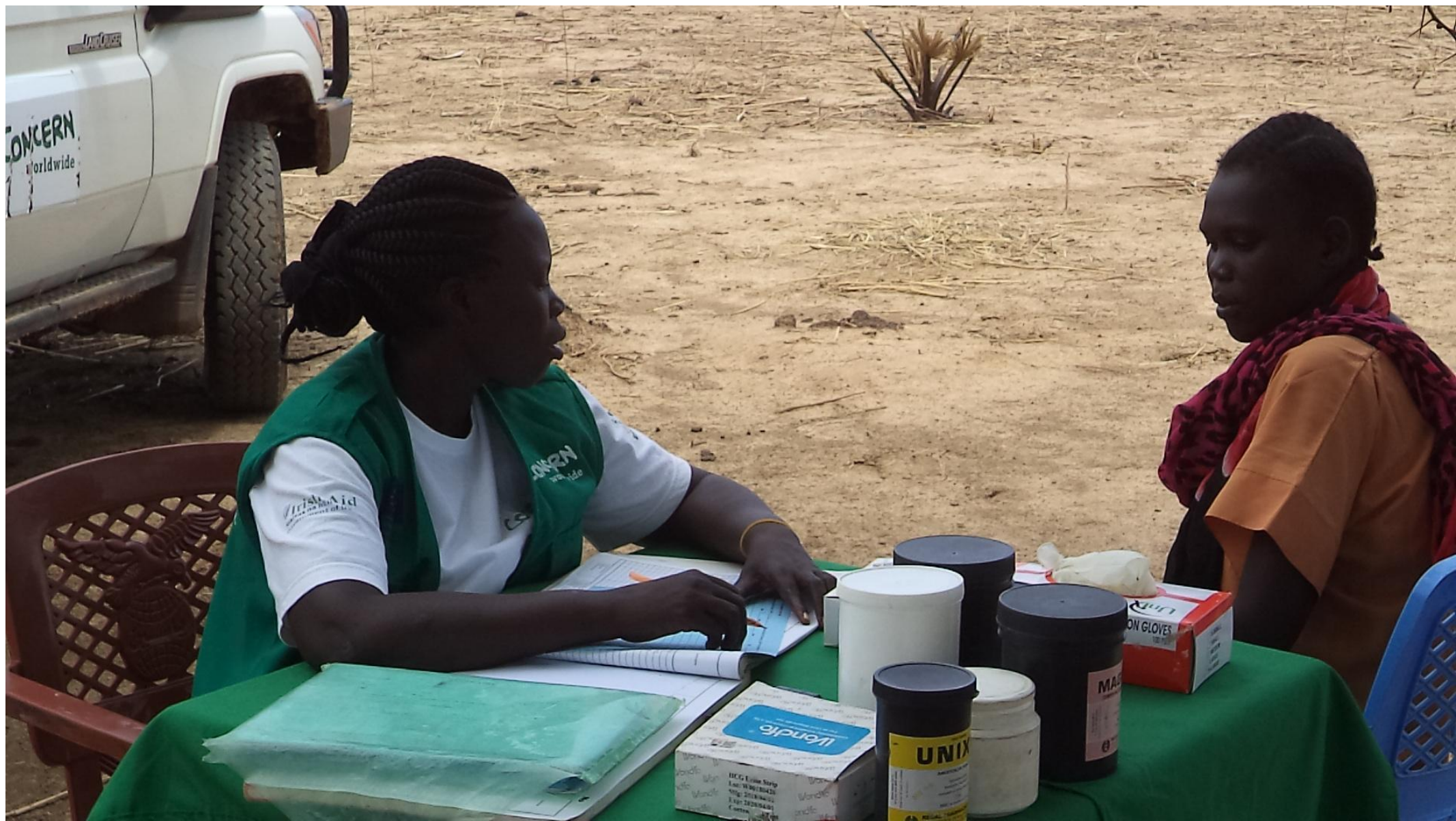
Reproductive health service during Mobile Clinic