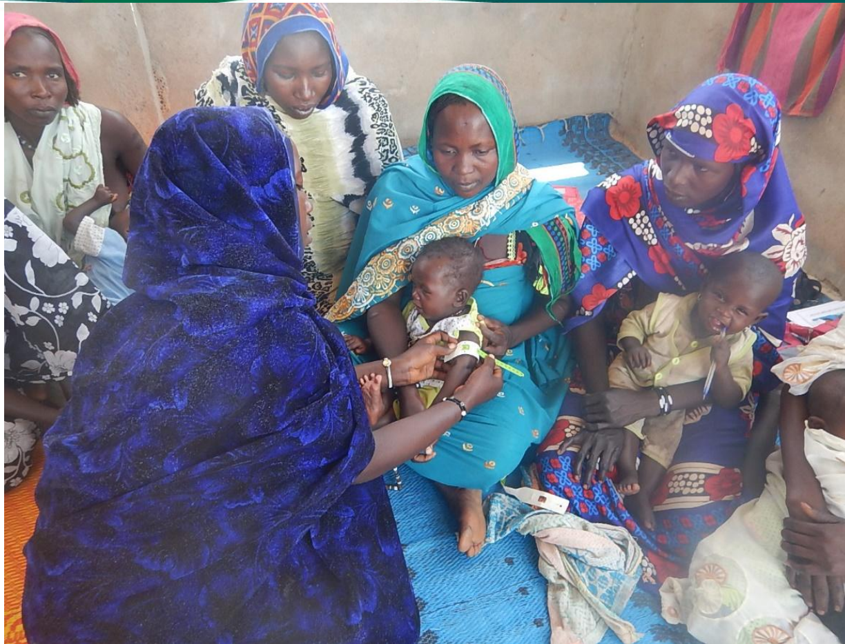
On screening of malnutrition among children from 6 to 59 months in Teissou village, Sila Province, Chad. Photo by Daouda, Concern Community Animator, March 2019