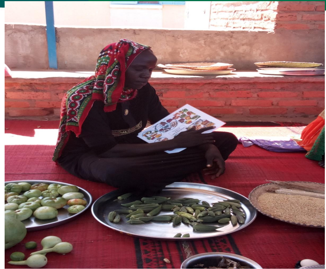
On dietary diversity for children aged 6-23 months at Kadjaské Health Center, Sila Province, Chad.