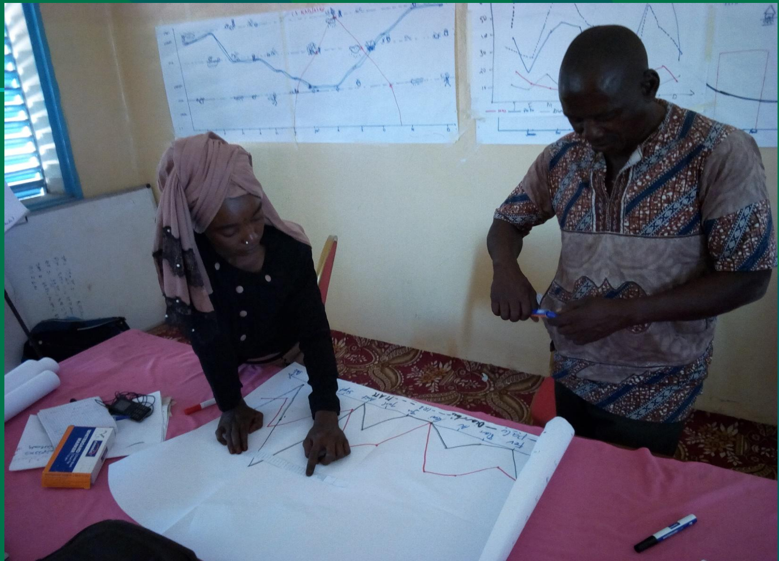
Training of care providers on the implementation of the CMAM Surge approach in Goz-Beida Health District , Sila Province Photo by Félix Health and Nutrition Assistant, March 2019